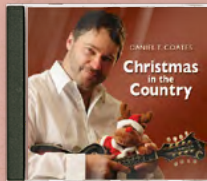
»CHRISTMAS IN THE COUNTRY«