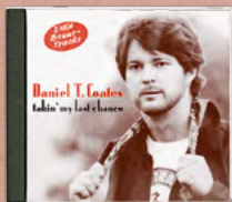
»TAKIN' MY LAST CHANCE«