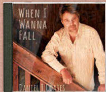
»WHEN I WANNA FALL«