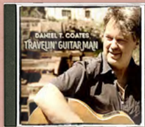
»TRAVELIN' GUITAR MAN«