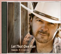
»LET THAT ONE RUN«