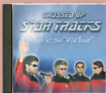
»GRASSED UP STAR TRACKS«